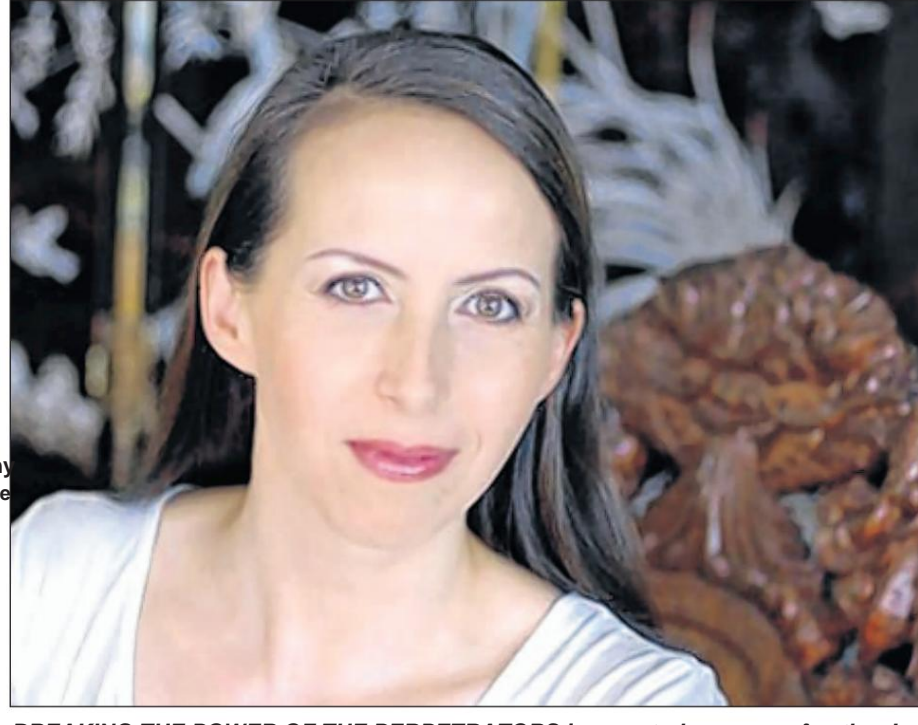
Müller, when it comes to sexual abuse.