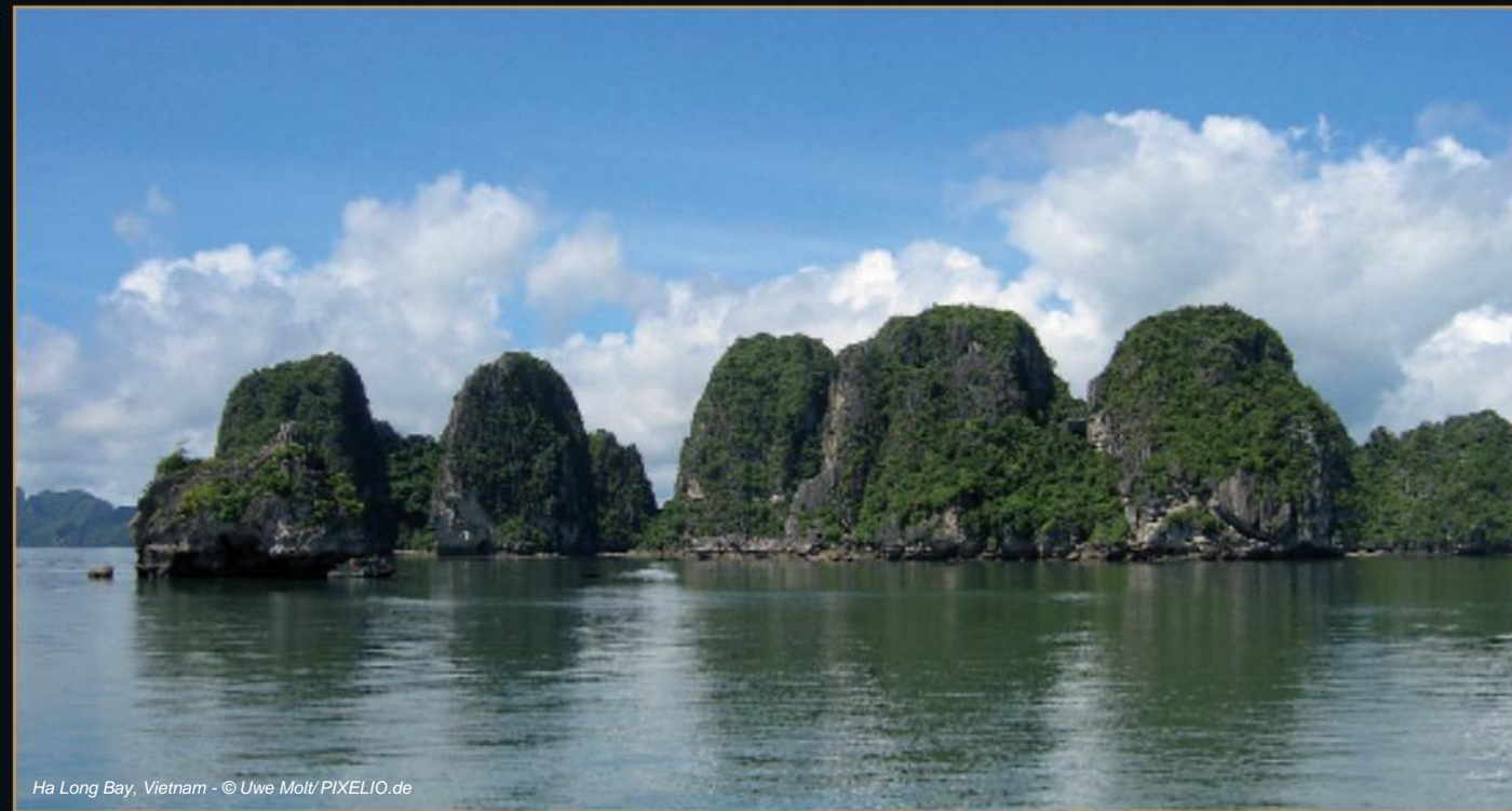
Ha Long Bay, Vietnam