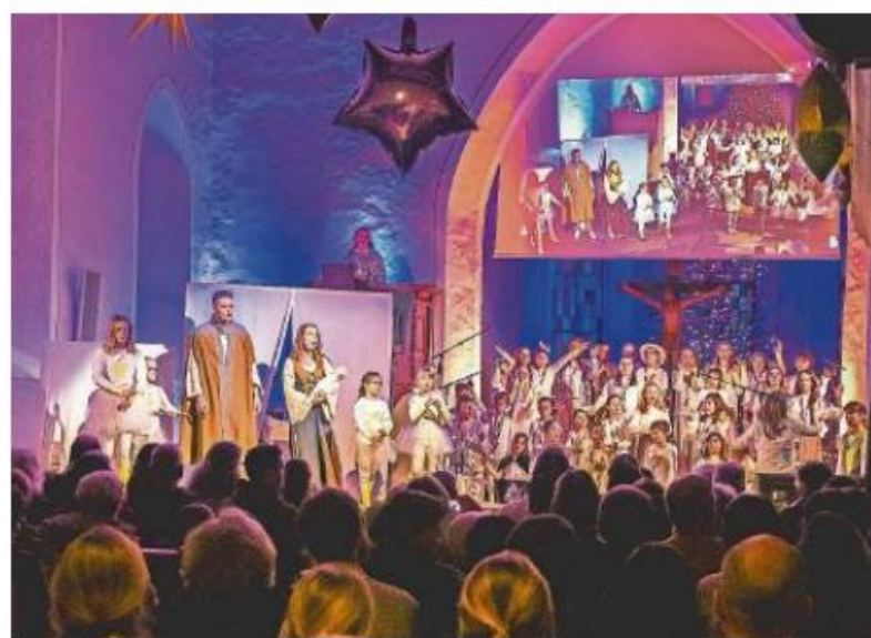
The audience watches the musical in the packed St. Leonhardskirche.

Twenty young people and twenty adults participated as soloists, actors, in the project choir, and worked in front of and behind the scenes. The overall direction