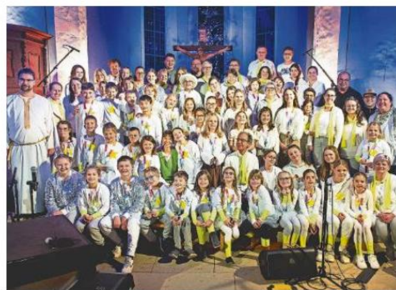
42 children are taking part in the Star Choir with great joy.