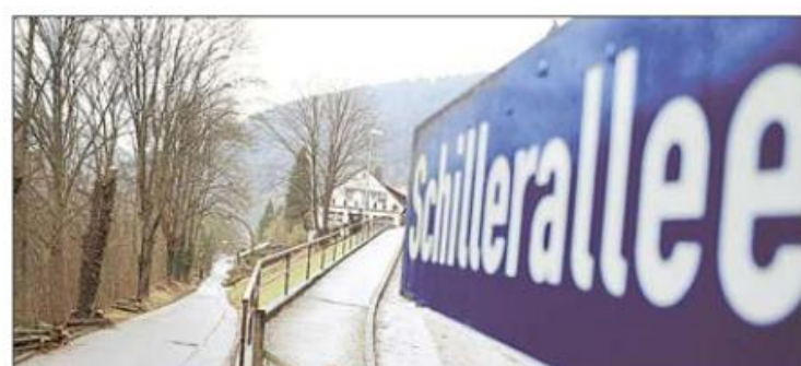
Sawed down: Bad Liebenzell is currently removing diseased trees.

MARZELL-FRAUENALB. At a Accident between Frauenalb and Two people were slightly injured on Thursday afternoon in Steinhäusle According to police, a 31-year-old driver came from an unknown Cause with his car from the roadway, a three-year-old Meter deep embankment and remained next to the AVG track. Despite the serious accident, the driver and his wife rescued from the vehicle with minor injuries. A five-month-old infant survived the accident unharmed in a baby carrier on the back seat. pol