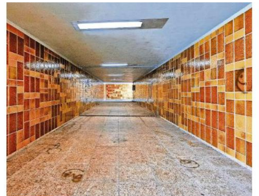
Contrary to the fears of many parents, the underpass is well-lit and clean inside. Only graffiti adorns the walls and floor of the old building.

toilets are now permanently closed due to vandalism. Instead, the sanitary facilities of the municipal administration. Against youthful recklessness such as Firecrackers in the underpass in the The community can do nothing to vent the situation.