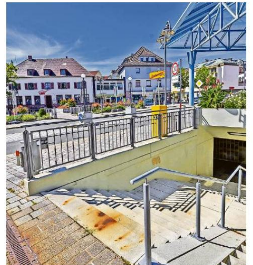
From above, the underpass at the market square in Birkenfeld appears gloomy. Parents find this section of the route to school is too scary for their children.

as well as pollution and removes them. For a larger clean-up campaign, the municipality even hires three or four a year a specialist company that works with high-pressure cleaners. In this way, approximately Graffiti removed. The former described as "filthy", public