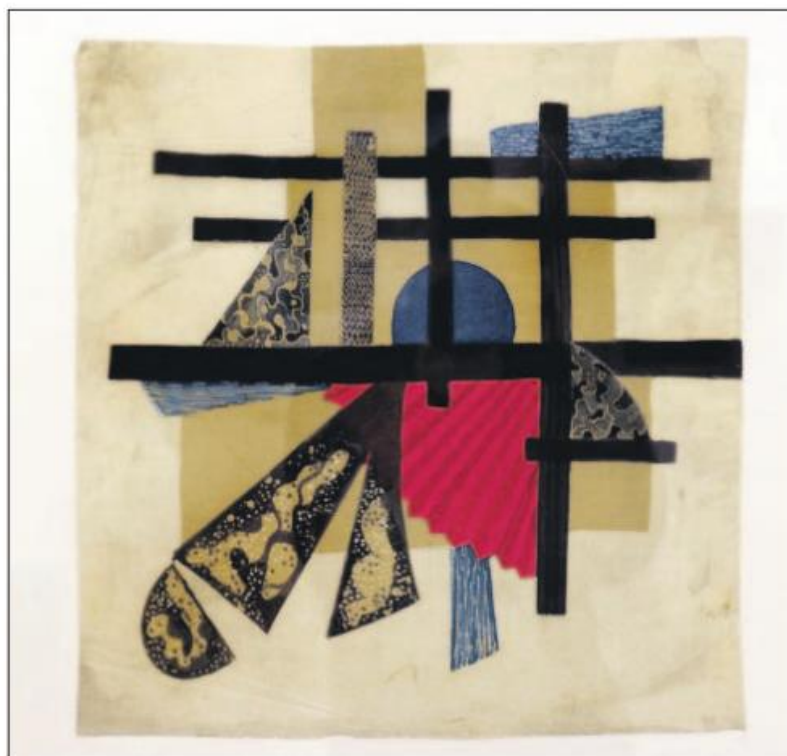
Colorful individual pieces: Many of Ilse Benninger's works (two untitled examples in the picture) testify to the artist's inventiveness.

She once processed her daughter's hair clippings into a fine paper pier shell or transformed the Leaves found on walks of sugar beet, rhubarb or Kohlrabi in magnificent natural images.