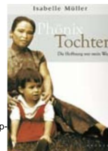
She processed her shocking experiences in the book "Phoenix Daughter", (Krüger Verlag, 17.95 €)