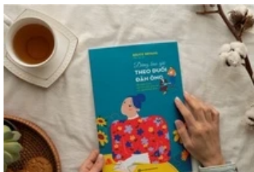
Help modern women be strong in love