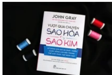
Differences between women and men