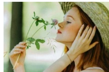
Learn to love yourself