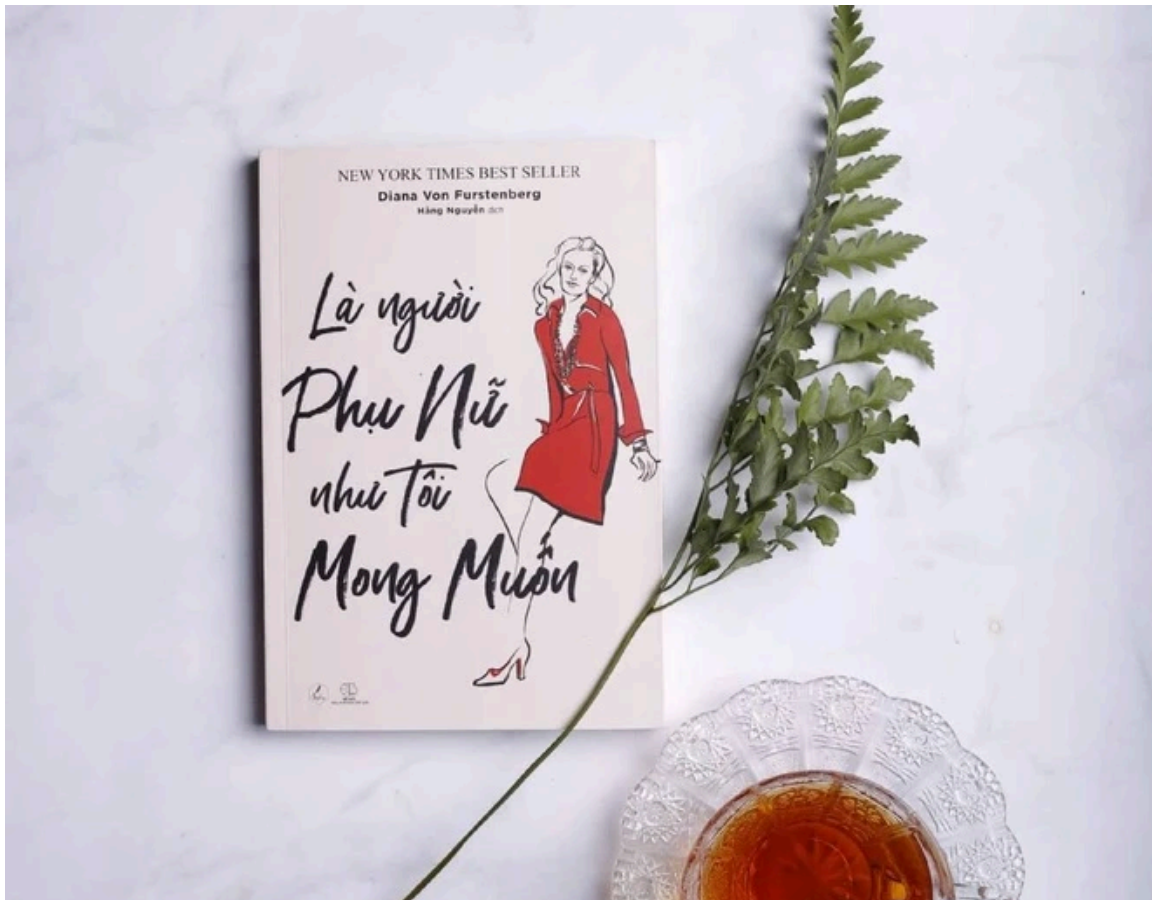
Diane von Furstenberg's autobiography makes the best-seller list of New York Times.

In addition, the work gives readers the strength, hope, and energy to live actively and bravely to conquer their own fears, thereby developing their own confidence.