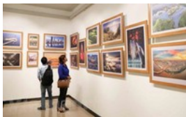
Coordinate the organization of the Young Photography Festival 2025