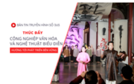
VHTTDD News No. 365: Promoting the cultural and performing arts industry towards sustainable development