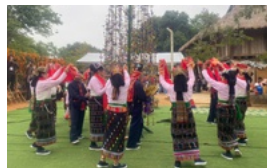
Recreate the unique Kin Chong Boom prosthesis of the Thai people of Qing