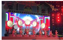
Activity indicator for Culture, Sports and Tourism February 18, 2025