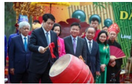
Activity indicator for Culture, Sports and Tourism February 17, 2025