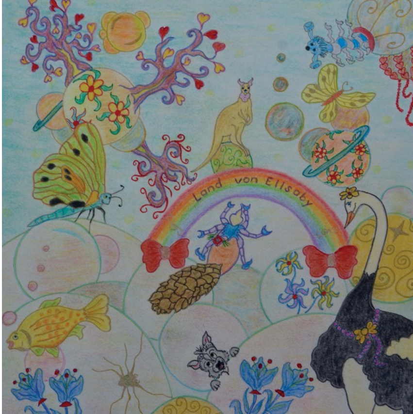
Paintings in "Hip Hop in the Land of Ellsaby"

Through this booklet, readers see in front of the memories filled with joy and sorrow and regret: a little sky of poetry is free to jump, experience the same nature, close to the grass, animals of the old children. Empathy with the children today living in adequate material conditions but lacking creative play space, the author wrote this book to relive the life and childhood spent. Hopefully these pieces will make someone laugh, laugh and snuggle and find themselves like they're back on childhood.