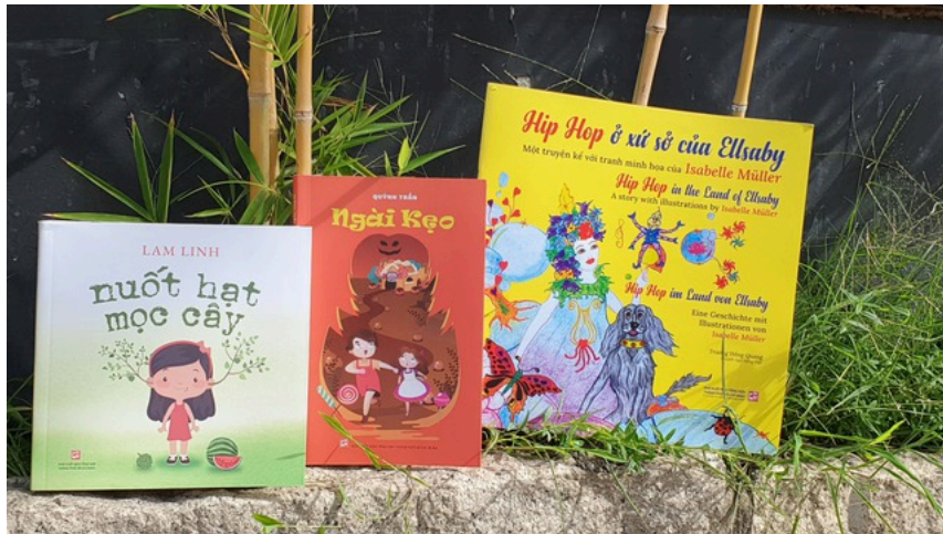
3 new books for children of NXB Synthetic TP.HCM