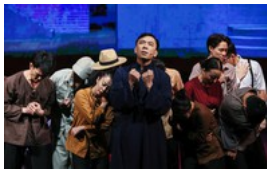
Fire from the Land: Recreating the life of Hanoi's first Secretary of State on the musical stage