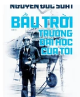
Lessons from the sky