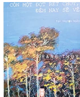
Not forgetting to support his character