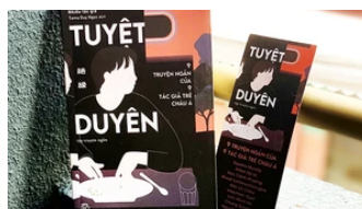
Belief where "inter-flowering snow blooms under deep pits "