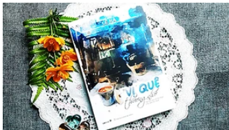
The smell of memory