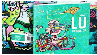
From pain lit up hope