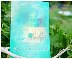
Heal the nostalgia