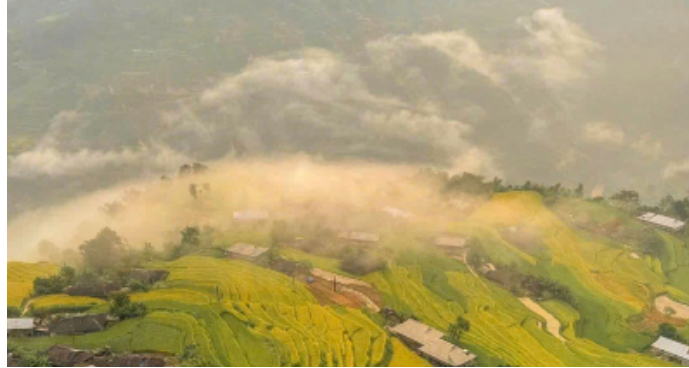
Ha Giang Weather on 24.2: The cold air intensifies, the East wind is good 2-3, it is cold