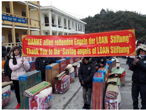
LOAN Foundation - Stiftung presents for students Drinking PTDTBT THCS Cai (Cauldron Cat)

During its operations in Ha Giang Province, LOAN-Stiftung Foundation projects have contributed to the development of the province's GD&T career, helping ethnic minority students in deep, remote districts of have better learning conditions; bring direct benefits to the community, contribute to hunger eradication, reduce poverty for people.