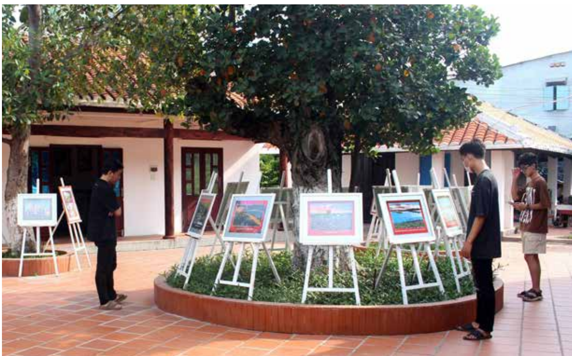
WATCH AND LEARN: Visitors view photos depicting the daily life of President Hồ Chí Minh at an exhibition launched by the Hồ Chí Minh Museum in Bình Thuận Province.

BÌNH THUẬN The Hồ Chí Minh Museum in Bình Thuận Province is opening a photo exhibition depicting the daily life of President Hồ Chí Minh.