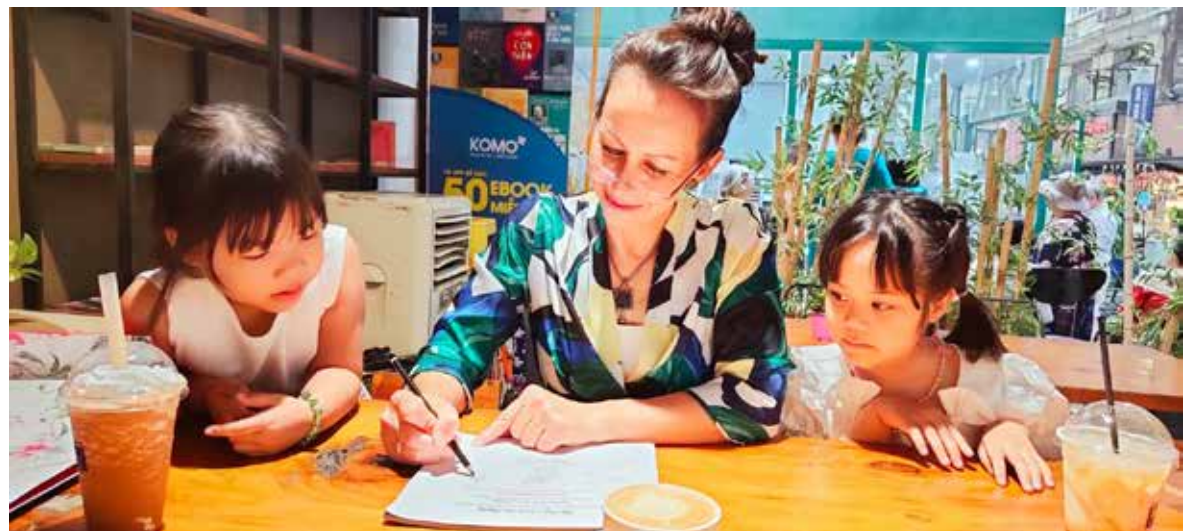
KIND FOR KINDER: Müller has released three children's books.

"This book shows how important it is to maintain and develop awareness of our surroundings. In the circle of life, everything is connected (humans, animals, nature) and we should cultivate this