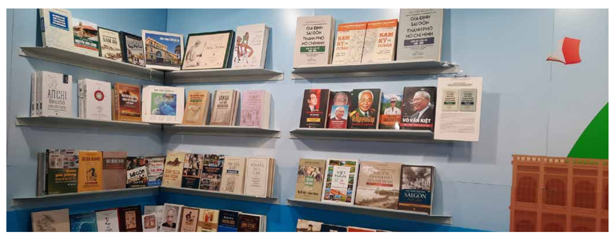
BOOK YOUR PLACE: Vietnamese books are introduced at Hö Chí Minh General Publishing House.